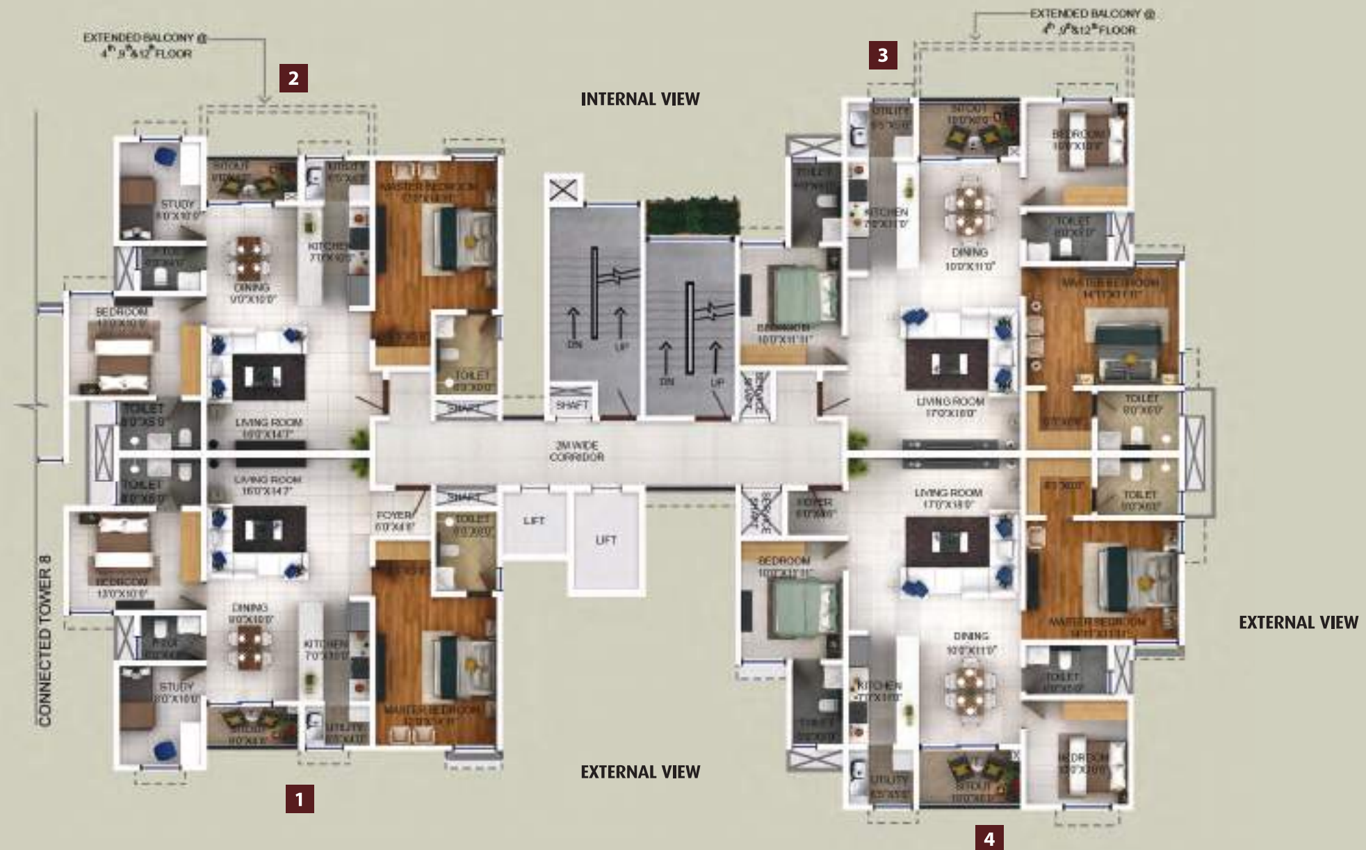
1st to 3rd Floor, 5th to 8th Floor, 10th Floor, 11th Floor & 13th Floor